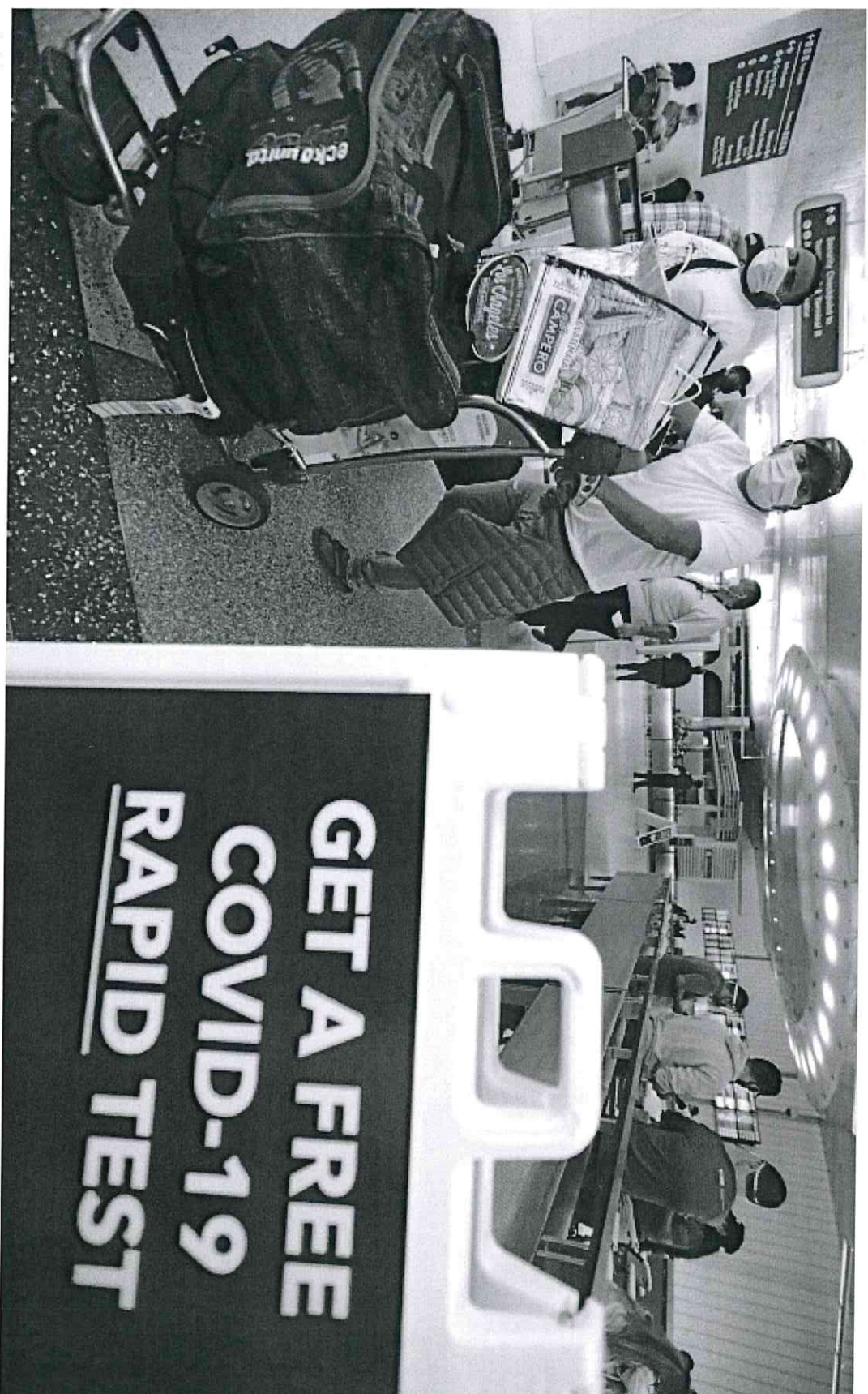
Arriving travelers walk through Tom Bradley International Terminal at Los Angeles International Airport this month.